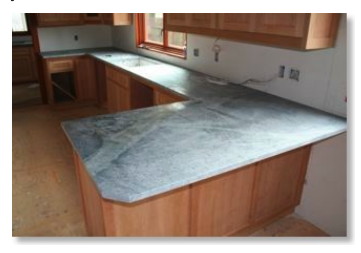
OILING JUST INSTALLED – NEVER OILED

Soapstone may be oiled with mineral oil to deepen the grays into black and bring out any color veins in the stone. The only time I oil it is two days before a party as I hate clearing off the counters.